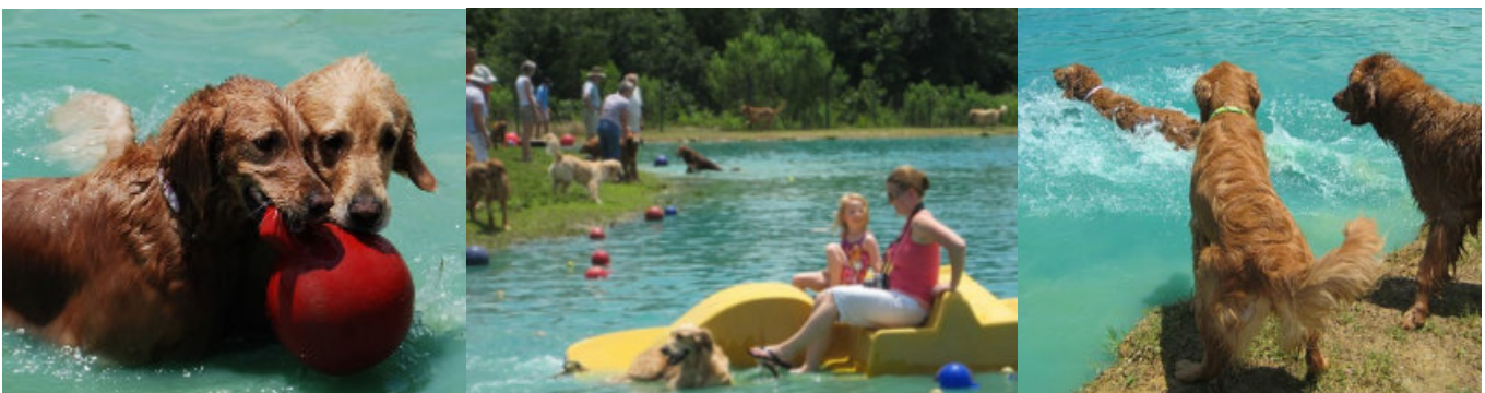
Dunk Your Dog Day 2010 was a splashing success, with 95 dogs playing in the pond at Wickersham's K-9 Ranch

Each Golden we have adopted has been unique and amazing. With each one we have learned, loved, and cried more than we ever thought possible. We will always be grateful to GRRCC for giving us the chance to invite so much happiness and meaning into our lives.