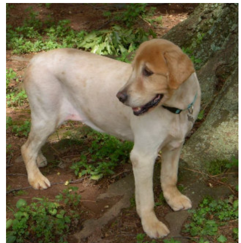
Rose sporting a close shave