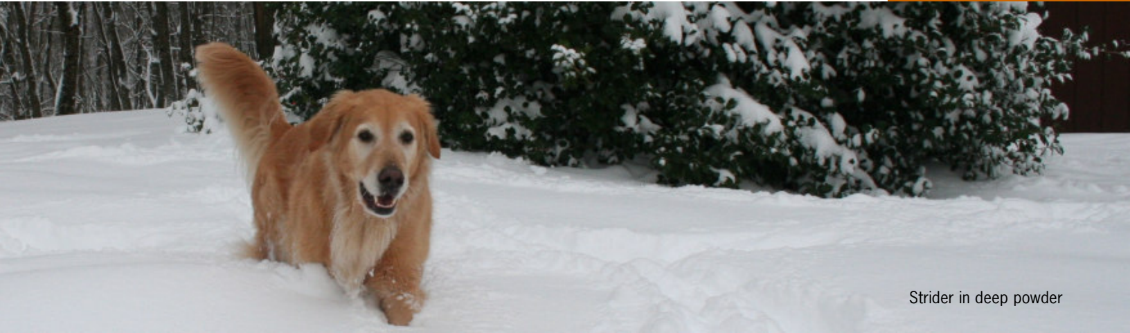
Strider in deep powder