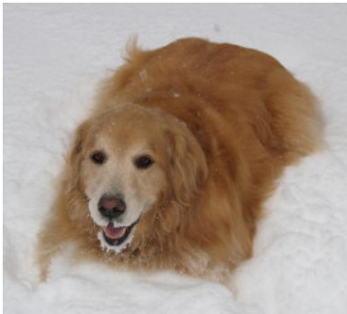
Rose in all her glory